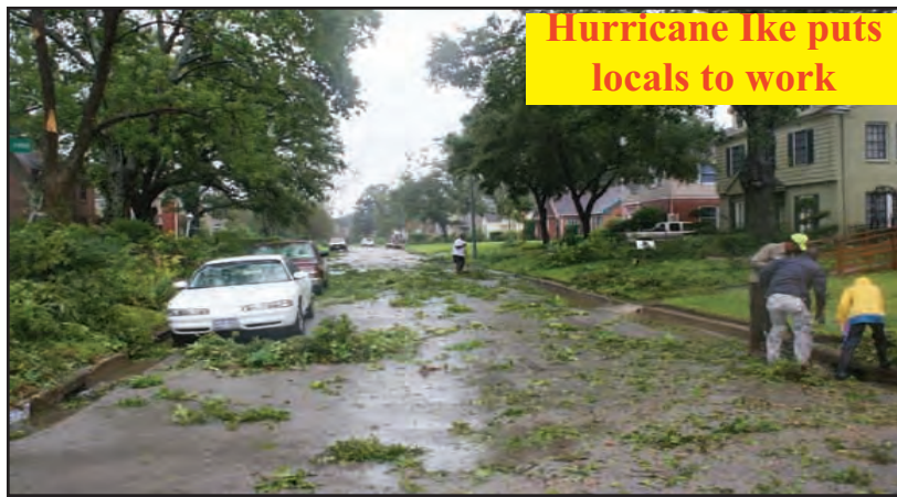
Hurricane Ike puts locals to work