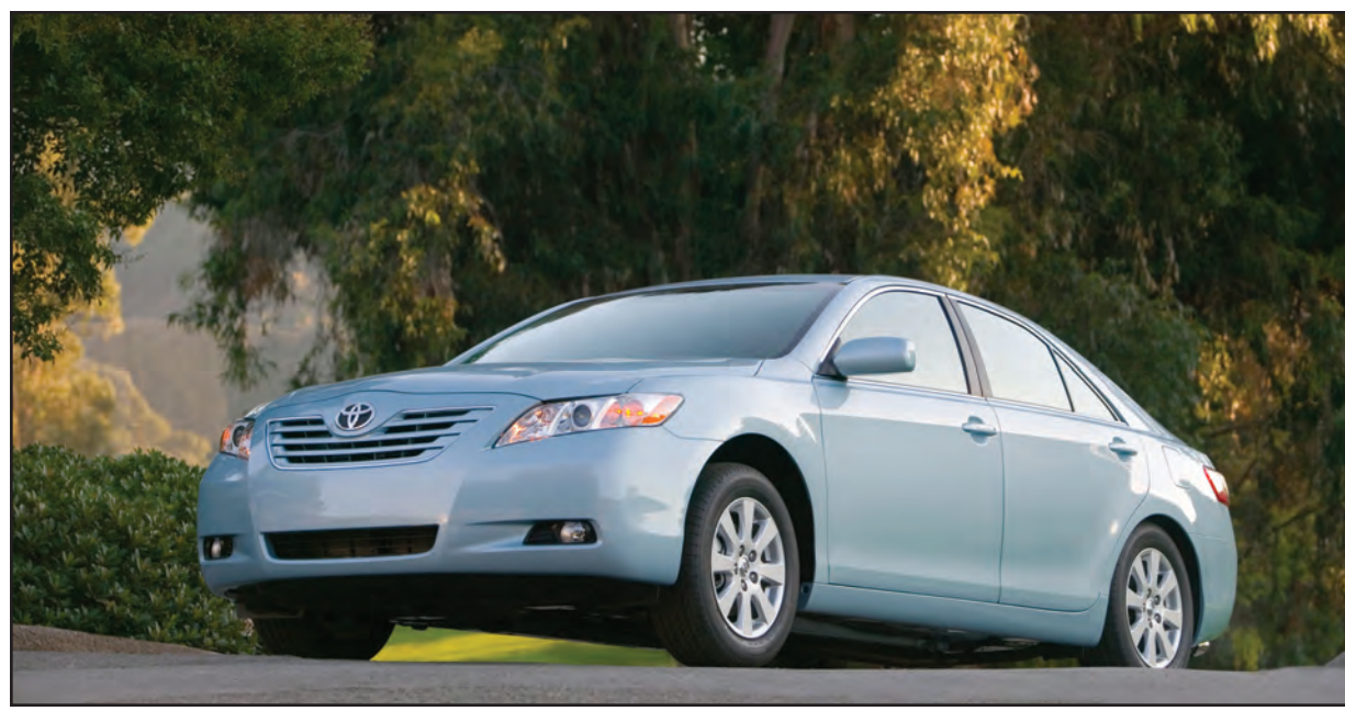
2008 Toyota CamryXLE

Email your classified advertisement to classifieds@houstonsun.com by Tuesday 5 PM or call 713-524-0786