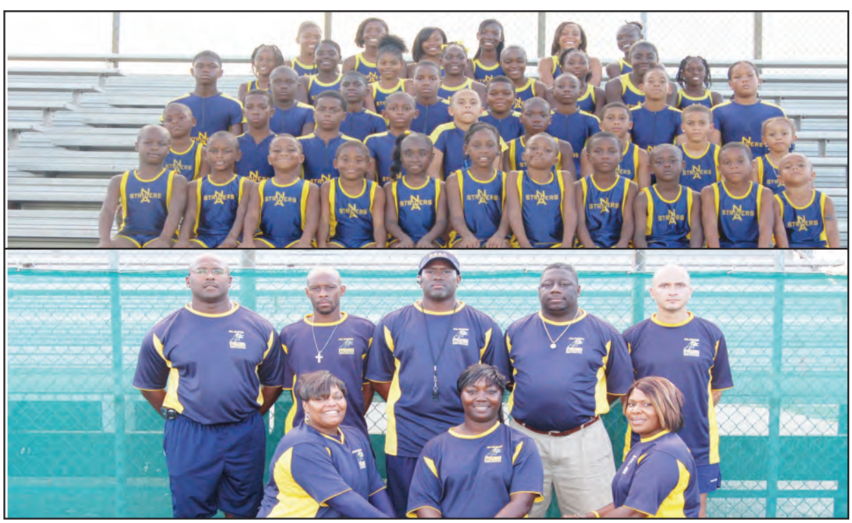
Northside Striders Track and Field Team and coaches

teur sports. During its early years, the