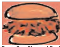
Bar-b-Que Chopped Beef