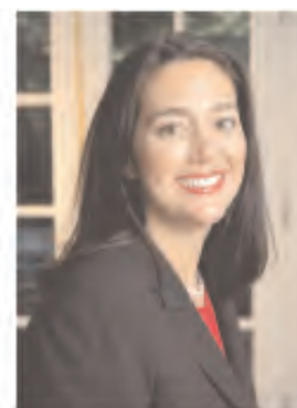
Erin Gruwell Teacher/Author