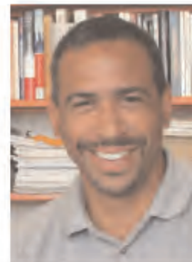
Pedro Noguera Professor