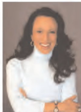
Maria Hinojosa PBS Senior Correspondent