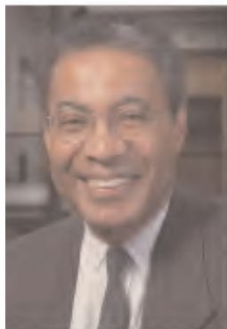
Alvin Poussaint Psychiatrist/Author