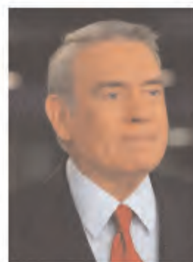
Dan Rather HDNet Anchor

"An Urban Education Agenda for the Next President"