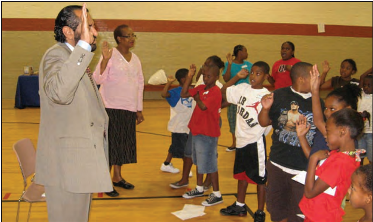
Children at Emancipation Park repeats Back-to-School Excellence and Honor pledge given by Congressman Al Green

The Democratic National Convention Committee said it will issue daily convention webcasts under the theme "Countdown to America's Future." The 15-minute segments will air daily at 4:30 p.m. EDT from Aug. 24 through Aug. 28 on DemConvention.com , Comcast's Video On Demand, and via satellite. A final program will